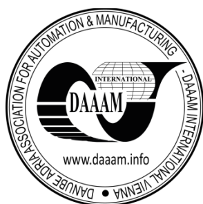
DAAAM INTERNATIONAL VIENNA UNIVERSITY OF TECHNOLOGY VIENNA - AUSTRIA