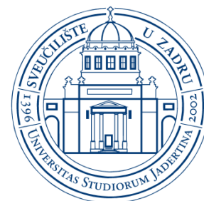
UNIVERSITY OF ZADAR ZADAR - CROATIA